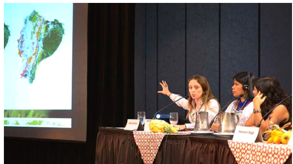
International Women's Earth & Climate Summit

allowed our low-cost production to maintain lip synch. Wirecast's Desktop Presenter software and an Epiphan VGA to USB converter allowed us to also intersperse speakers' PowerPoint slides and live Skype video calls that were displayed on the big-screen.”