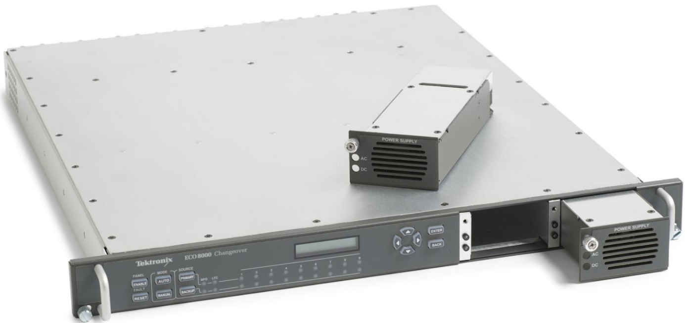
Option DPW backup power supply