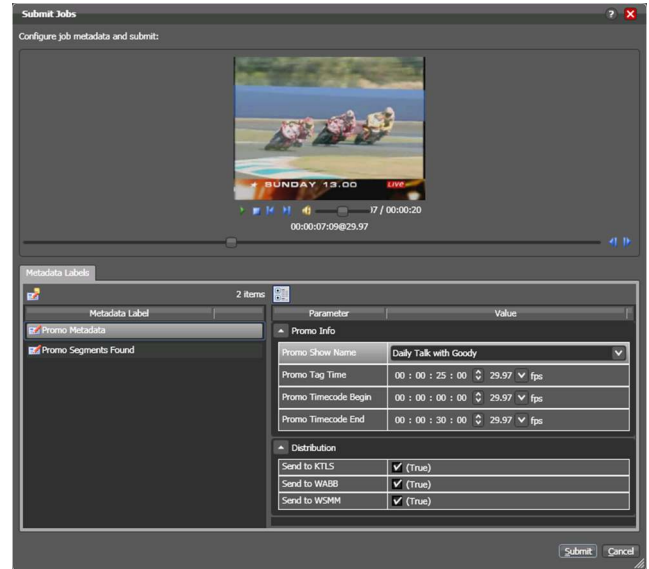
Vantage Workflow Portal

Operators can use the Vantage Workflow Portal client application to access the Vantage database from their desktop. Browsing for assets, choosing distribution channels, applying branding and commercials, reviewing black removal points, and entering metadata is all performed in a single, unified user interface.