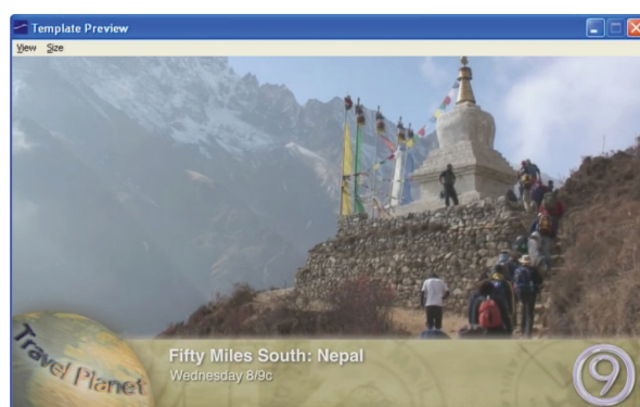
Template Preview Window