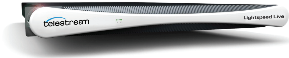
Lightspeed Live 1RU Appliance